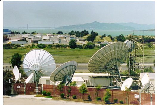
TLN uplink at ABS-CBN in Richmond, CA

The Commission's mandate also specified that as of March 1, 2007, all new TVs must include digital tuners. This rule prohibits the manufacture, import,