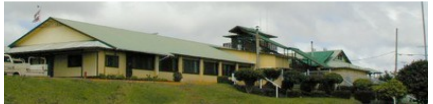
Kulani Correctional Facility

school graduates. We have a combination of ABE teachers from the community as well as qualified inmates teaching and tutoring other inmates. We also provide two vocational programs in cooperation with Hawaii Community College, Automotive Mechanics Technology and Environmental Horticulture. Both are very successful programs that prepare inmates with the skills and knowledge needed for rewarding employment and reentry in the community. In addition, we offer on-site computer classes, Hawaiian arts and crafts, Transition (preparing for employment and community reentry), Cognitive Skills, Parenting, literature and Toastmasters International Club.